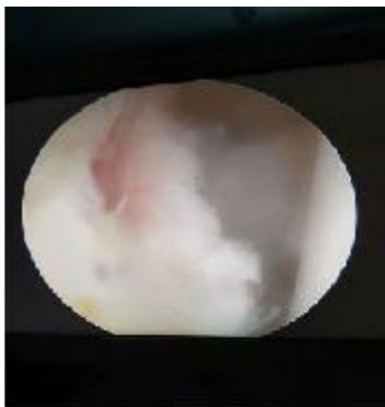
Shoulder Arthroscopy showing detached lining in a patient with shoulder dislocation