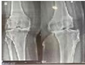
Deformed bent painful knee before knee replacement .