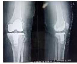
Deformity fully corrected, new kneejoint in place, happy patient.