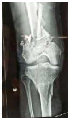
Open fractures with multiple fragments of all 3 bones of the knee in 78 yrs. patient

CIMS Trauma Center, one of the best in Gujarat, is fully equipped to provide comprehensive multi-speciality emergency medical services to patients suffering major accident & industrial injuries.