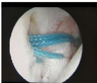
Detached lining reattached successfully to the socket with keyhole surgery (Arthroscopy)

Attractive all inclusive packages for most orthopaedic surgeries including TKR,THR, Fracture surgeries, Arthroscopy,etc.