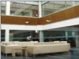
MkÉh y™uy MðA ðkíkðhý