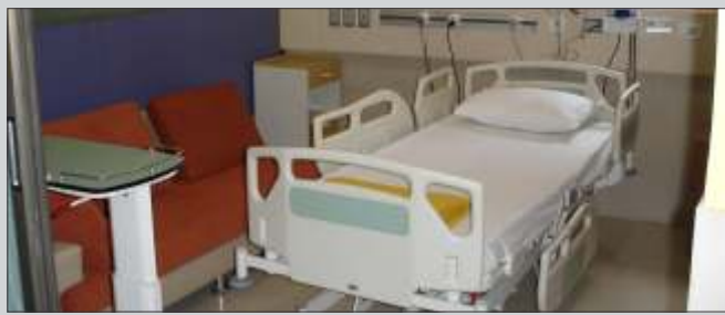
Mkkhe MkkÁLk-Mkk{ðká ðkðk ykhk{Ékþf Y{ku íkÚkk R÷ðxðLkf xðe-çkz