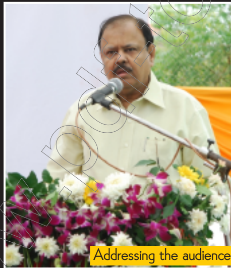
Addressing the audience