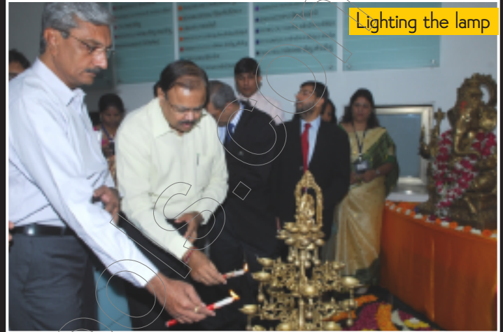
Lighting the lamp