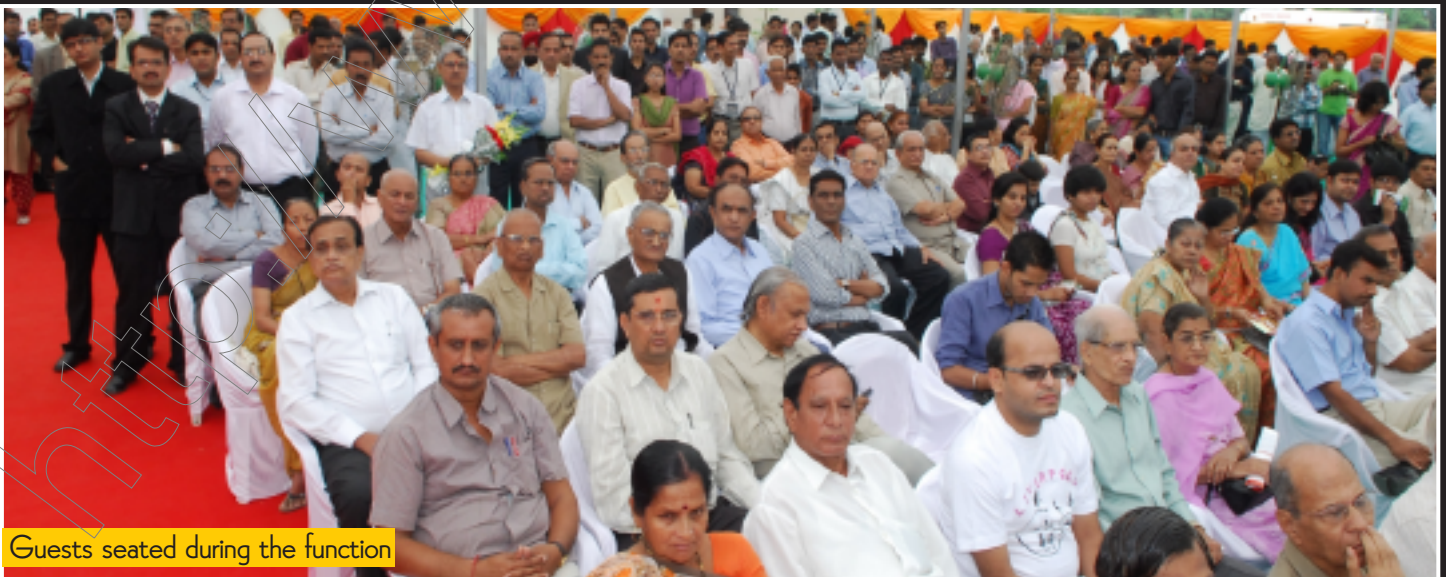
Guests seated during the function