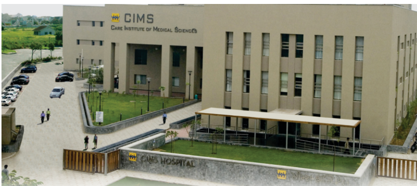
A Seven Star Hospital with Seven Star services at affordable rates