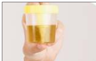
P n e L k L k e í k Á k k M k