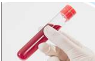
÷ k n e L k e í k Á k k M k

{ k ū k k y L k u o k x k L k k f L M k h L k e í k Á k k M k f h ō k { k x u