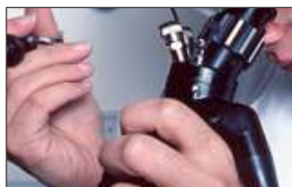
y L z k M f k á k e