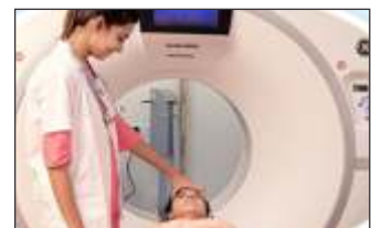
M f L k

r L k Ä k L k - r L k ō k h y > M k s h e > h a z y p L k > r f { k ū k k h k Á k e