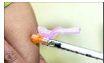
y L Ä k e ð e í k Á k k M k