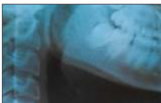
y ō M k - h u